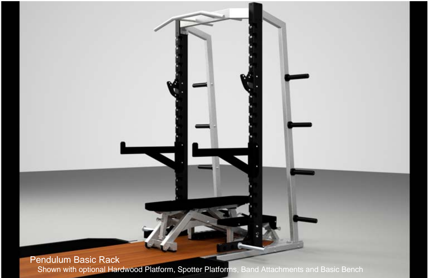
Pendulum Basic Rack Shown with optional Hardwood Platform, Spotter Platforms, Band Attachments and Basic Bench

The ultimate in versatility and safety. The Pendulum Basic Rack provides ample space for a variety of exercises allowing you to optimize floor space while working more athletes. Each rack includes incremental height settings from 8" to 84" in 4" increments and are clearly denoted with plastic number strips for quick positioning of attachments. Racks come standard with built-in chin-up bars, lock n load hooks, safety bars, and weight-plate storage horns.